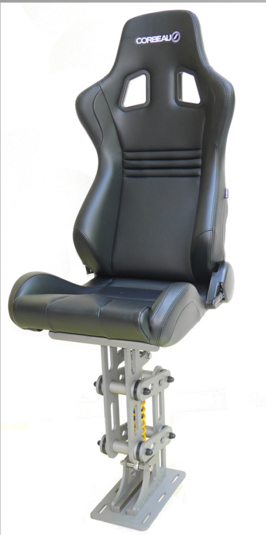
Bucket Ver Mil Corbeau EVO BOSS 2