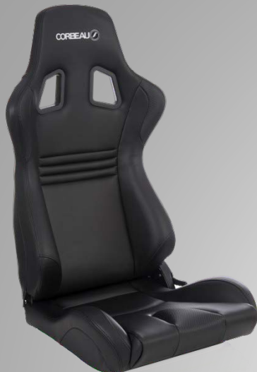
Corbeau EVO BOSS 2