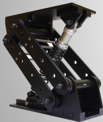
Suspension Ver. PL